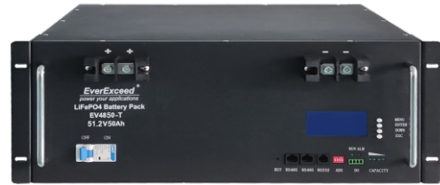
*the LCD display is optional

EverExceed LiFePO4 solutions are more advanced, highly efficient and has many advantages over the traditional Lead Acid technology.