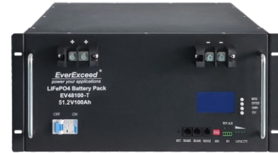
*the LCD display is optional

EverExceed LiFePO4 solutions are more advanced, highly efficient and has many advantages over the traditional Lead Acid technology.